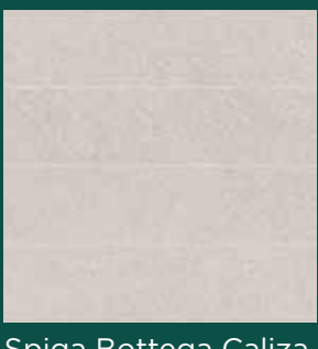
Spiga Bottega Caliza