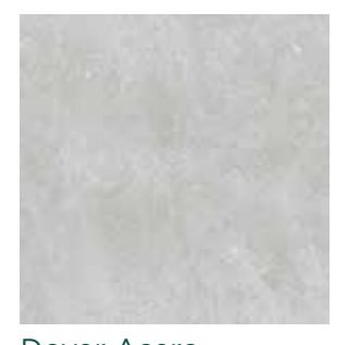
Dover Acero *Recommended for Kitchen & Dining rooms