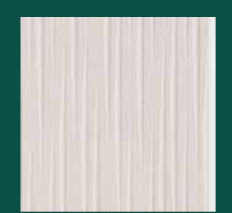
Dover Modern Line Caliza