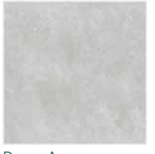
Dover Acero *Recommended for Kitchen & Dining rooms