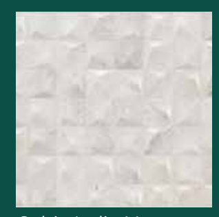
Cubic Indic Matt