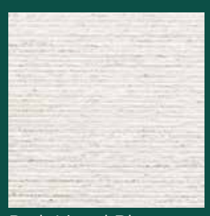
Park Lineal Blanco