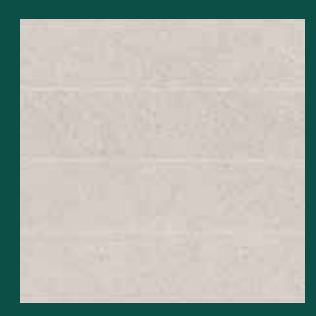
Spiga Bottega Caliza